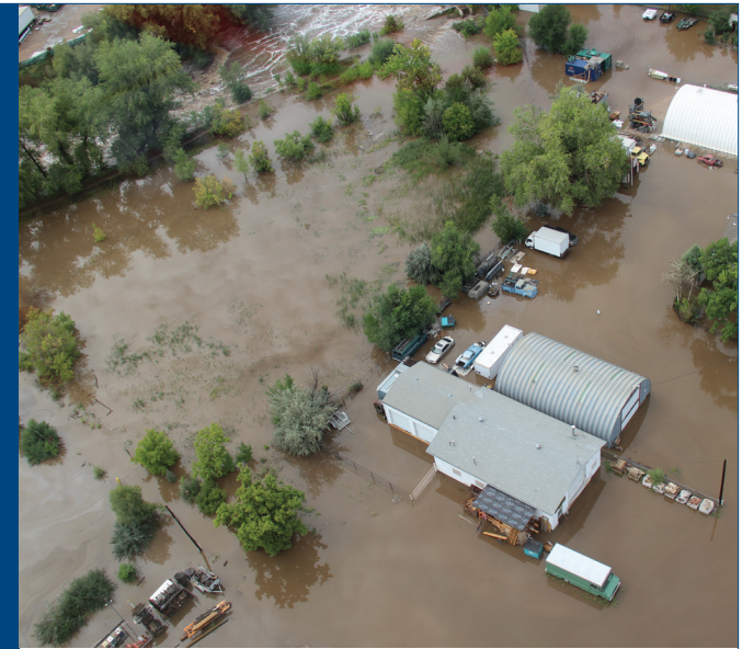
Poudre River flooding along Vine Drive in September 2013

Fort Collins Utilities would like to partner with you. As professionals in the real estate, lending, insurance and appraisal industries, you have a unique opportunity to help Fort Collins Be Flood Ready.